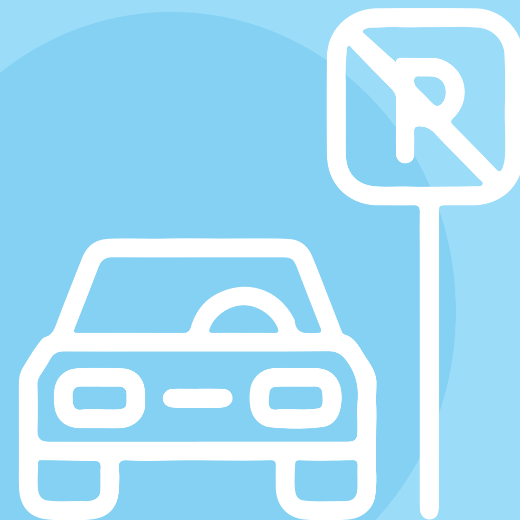
Removal of on-street parking along U.S. 1 from State Road 207 to the St. Augustine City Gates