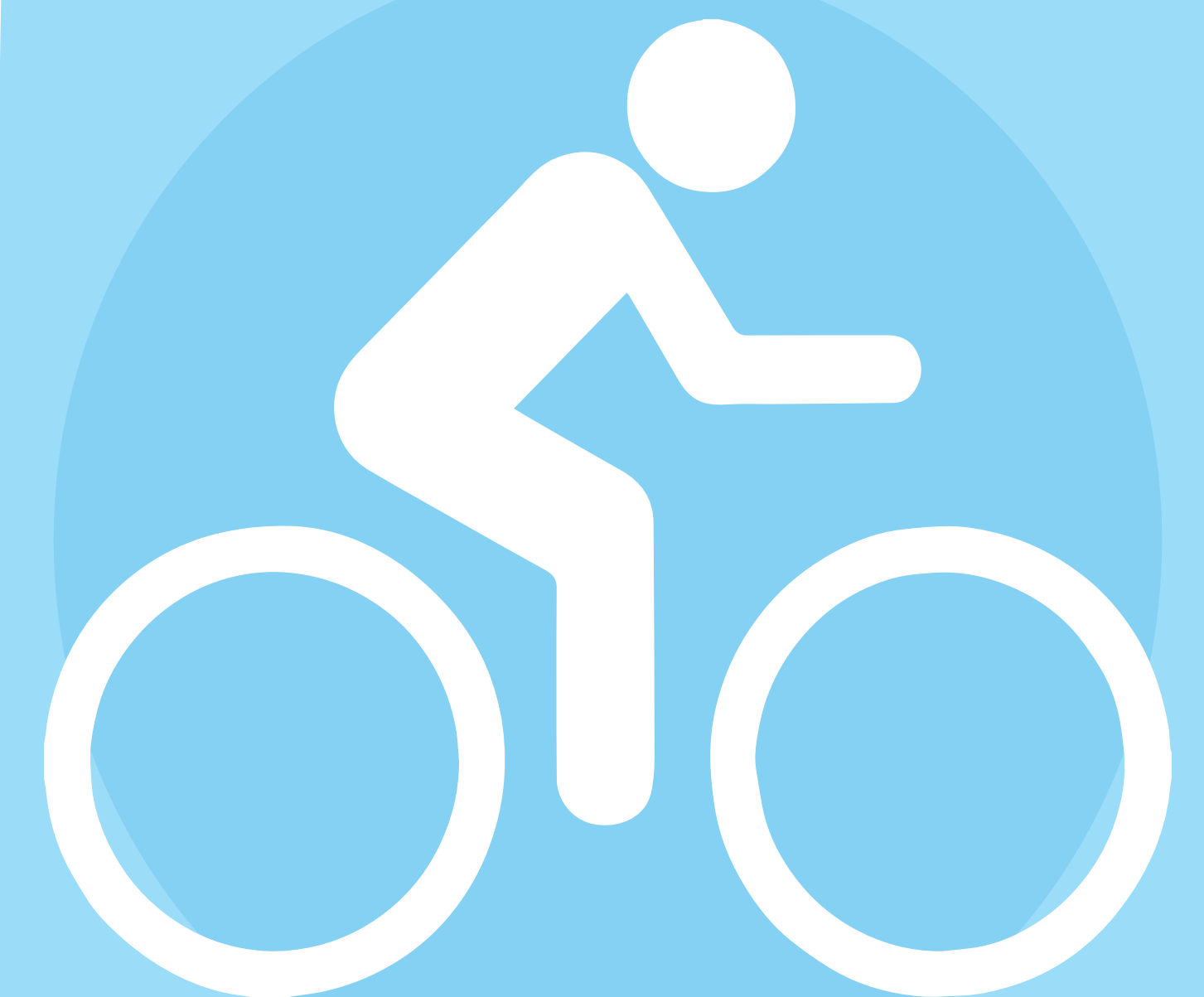
Install bicycle lanes